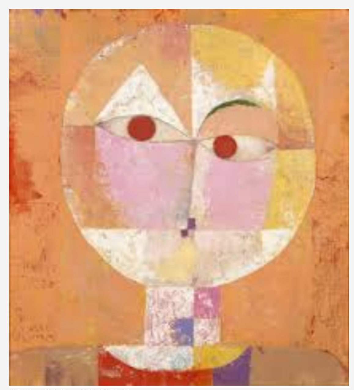
PAUL KLEE, SCENECIO

Maïti has the energy of a lioness and the voice of a bird. Together with her soft inner animal nestled in her body, they compose wonderful songs which Maïti sings to her whole village. Wondrous sounds and colours breathe out of her.